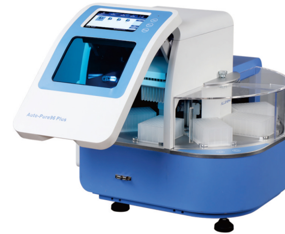
With openable carbon door