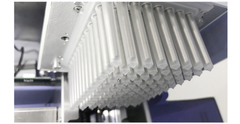
Patent structure of magnetic rod sleeve loading and unloading, more stable and reliable.